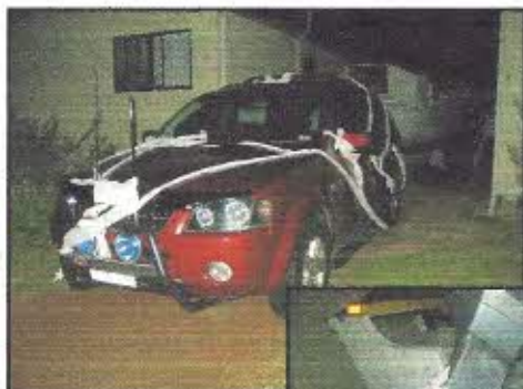
Best decorated outfit ???